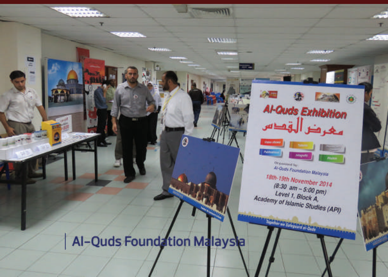
Al-Quds Foundation Malaysia